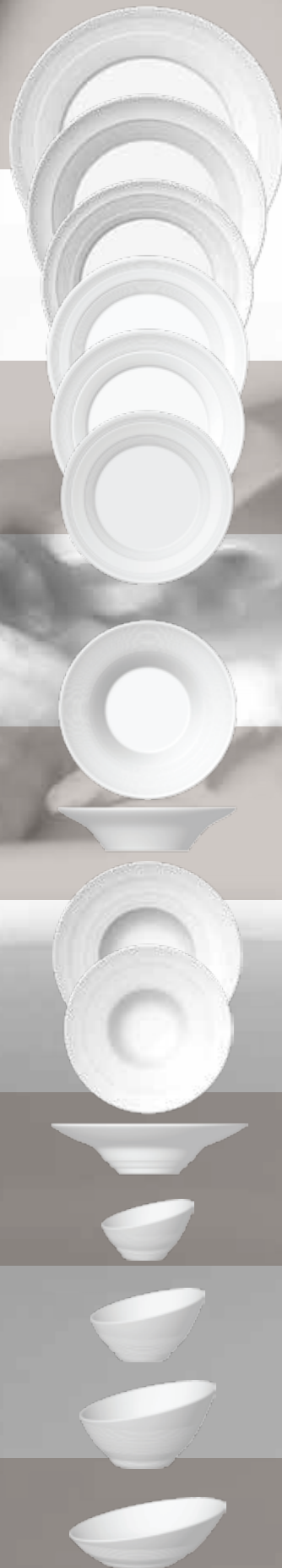
FLAT PLATTER M 0307 31.0 cm.

BONE CHINA | FINE CHINA | PORCELAIN | MAXADURA