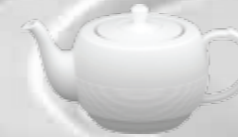
TEA POT WITH LID M 0319/L 0.6 ltr.