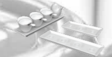
CONDIMENT TRAY M 0334 8.5 X 22.5 cm. M 0333 8.5 X 30.0 cm.