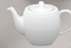
COFFEE POT WITH LID M 0318/L 0.5 ltr.