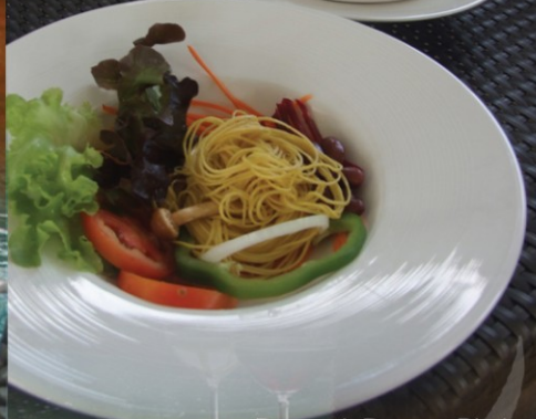
Round Deep Plate