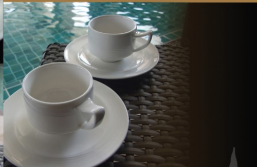
Coffee Cup & Saucer Stackable