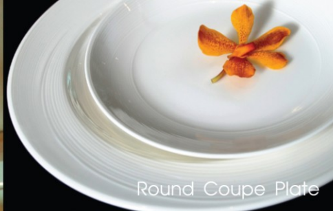
Round Coupe Plate