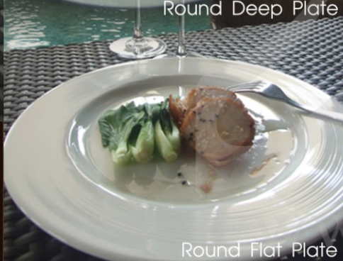
Round Flat Plate