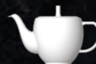
COFFEE/TEA POT WITH LID N 6840/L 1.1 ltr.