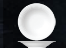
SOUP PLATE N 6806 23.5 cm. (9 1/4") 460 g.