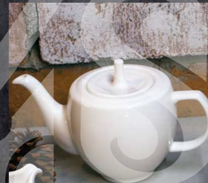
COFFEE POT WITH LID