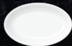
OVAL PLATTER N 6809 26.0 X 40.0 cm. N 6810 22.0 X 35.0 cm. (8 5/8" x 13 3/4") 650 g. N 6811 21.0 X 32.0 cm. (8 1/4" x 12 5/8") 649 g.