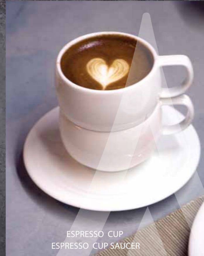
ESPRESSO CUP ESPRESSO CUP SAUCER