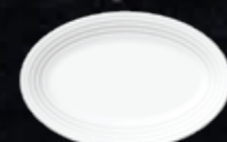
OVAL PLATE N 6812 19.5 X 30.0 cm. (7 5/8" x 11 7/8") 444 g. N 6813 17.5 X 27.0 cm. (6 7/8" x 10 5/8") 398 g.