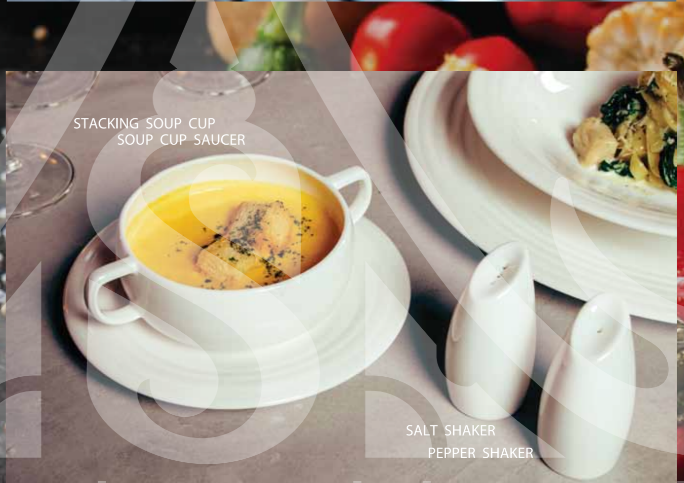
STACKING SOUP CUP SOUP CUP SAUCER