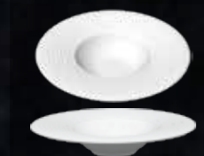
PASTA PLATE N 6808 28.0 cm. 11 1/8") 652 g.