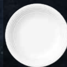
FLAT PLATTER N 6807 31.0 cm. (12 1/4") 822 g.

BONE CHINA | FINE CHINA | PORCELAIN | MAXADURA