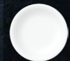
FLAT PLATE N 6801 27.0 cm. (10 5/8") 548 g. N 6802 24.0 cm. (9 1/2") 499 g. N 6803 21.0 cm. (8 1/4") 361 g. N 6804 18.0 cm. N 6805 16.0 cm. (6 1/4") 169 g.