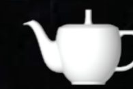
COFFEE POT WITH LID N 6821/L 0.5 ltr.