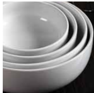
Salad Bowls are available in various sizes.