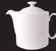
COFFEE POT W/LID P 0971/L 0.76 ltr. (26.75 oz.) 550 g. P 0972/L 0.50 ltr. (17.60 oz.) 396 g.