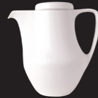
COFFEE POT W/LID P 0929/L 0.56 ltr. (19.88 oz.) 438 g. P 0932/L 0.35 ltr. (12.32 oz.) 348 g.