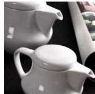
Intelligent functional of pots offers non-drip spout perfect-fit lids.