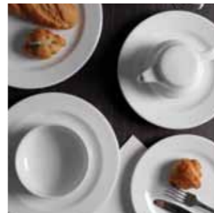
Timeless design perfectly combined with practical feature.

THIS IS A COMPLETE SHAPE DESIGNED EXCLUSIVELY FOR HOTELS AND RESTAURANTS.