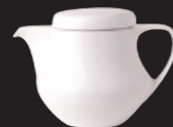
TEA POT W/LID P 0934/L 0.85 ltr. (29.92 oz.) 657 g. P 0933 0.43 ltr. (15.31 oz.) 369 g. P 0929-L ONLY LID