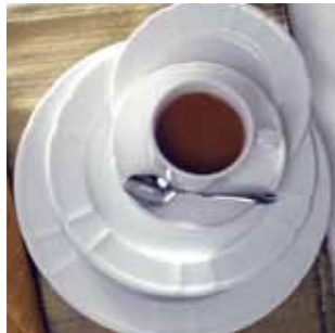
Various sizes enable to serve multi-functions.