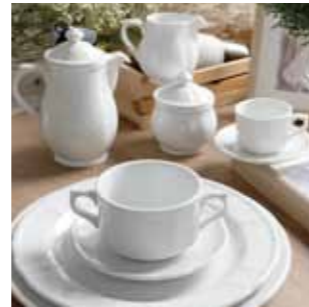
Classic design to satisfy all coffee lovers.

THIS CLASSY EUROPEAN STYLE PROVIDES AN ELEGANT APPEARANCE, DELICATE RELIEF, BUT EXCELLENT DURABILITY.