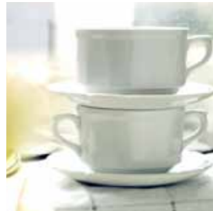
Main items are stackable to minimize the storage area.