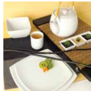
Minimalist rectangular plates allow the chef to out shine his expertise & creativity, available in various sizes.