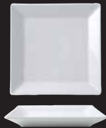
SQUARE PLATE P 4162 28.5 cm. (11 1 / 4 " ) 1,440 g. P 4168 25.0 cm. (9 7 / 8 " ) 967 g. P 4155 21.5 cm. (8 1 / 2 " ) 680 g. P 4163 15.5 cm. (6 1 / 8 " ) 297 g. P 4169 12.5 cm. (4 7 / 8 " ) 145 g.