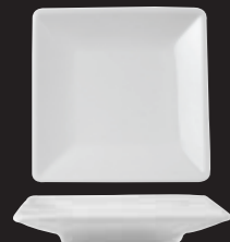
SQUARE DISH P 41/3802 15.0 x 15.0 cm. (5 7 / 8 " x 5 7 / 8 " ) 329 g.