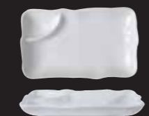
RECTANGULAR PLARE WITH DIVISION P 4131 13.0x21.5 cm. (5 1 / 8 " x 8 1 / 2 " ) 445 g.