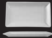
RECTANGULAR DISH P 41/3803 13.5x23.0 cm. (5"x9 1 / 8 ") 457 g. RECTANGULAR PLATE P 4179 16.5x27.5 cm. (6 1 / 2 " x 10 3 / 4 ") 670 g.