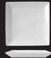
SQUARE FLAT PLATE SQUARE PLATE P 4107 30.0 cm. (11") 1,810 g. P 4166 25.5 cm. (10 1 / 8 " ) 900 g. P 4108 24.0 cm. (9 1 / 2 " ) 867 g. P 4109 19.0 cm. (7 1 / 2 " ) 503 g. P 4110 14.0 cm. (5 1 / 2 " ) 268 g.