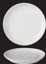
FLAT PLATE P 41/1401 19.0 cm. (7 1 / 2 " ) 335 g. P 41/1402 17.0 cm. (6 3 / 4 " ) 195 g. P 41/1403 14.0 cm. (5 1 / 2 " ) 160 g.