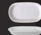
OVAL TRAY P 41/3541 9.0x15.5 cm. (3 1 / 2 " x 6 1 / 8 " ) 163 g.