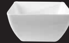
SQUARE SALAD BOWL P 4120 26.5 cm. (10") 2,020 g. P 4159 23.0 x 23.5 cm. (9 1 / 8 " x 9 1 / 4 ") 1,430 g. P 4121 19.0 cm. (7 1 / 2 " ) 1,125 g. SQUARE BQWL P 4173 16.5 cm. (6 1 / 2 " ) 550 g. P 4122 12.5 cm. (4 7 / 8 " ) 385 g.