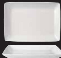
RECTANGULAR PLATTER P 4139 23.0x33.0 cm. (9 1 / 8 " x 13") 1,406 g.