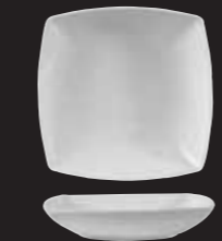
SQUARE SOUP PLATE P 4123 20.5 cm. (8 1 / 8 " ) 600 g. P 4124 18.0 cm. (7 1 / 8 " ) 330 g.