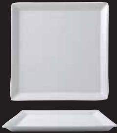
SQUARE PLATE P 4184 35.0 x 35.0 cm. (13 3 / 4 " x 13 3 / 4 ") 1,640 g.

Capacity & weight could be varied +- 10%