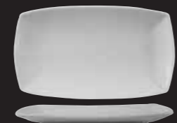
RECTANGULAR PLATTER P 4126 36.0 cm. (14 1 / 8 " ) 930 g. P 4119 32.0 cm. (12 5 / 8 " ) 800 g. RECTANGULAR PLATE P 4151 16.0x27.0 cm. (6 1 / 4 " x 10 5 / 8 " ) 550 g.