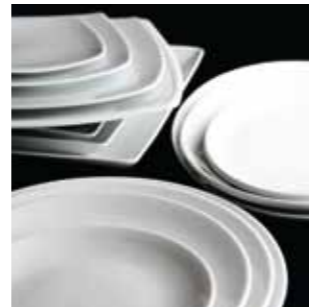
Versatility for imaginative food presentation.