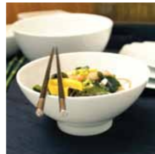
Exclusive design of noodle bowls for oriental cuisine.