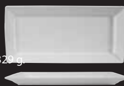
RECTANGULAR PLATTER P 4135 17.8x36.8 cm. (7" x 14 1 / 2 " ) 1,130 g. P 4167 17.5x29.0 cm. (6 7 / 8 " x 11 3 / 8 " ) 810 g.