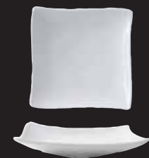
SQUARE DEEP PLATE P 4180 22.0 x 22.0 cm. (8 3 / 8 " x 8 5 / 8 " ) 717 g.