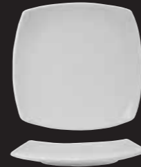
SQUARE COUPE PLATTER SQUARE COUPE PLATE P 4106 30.0 cm. (11") 1,530 g. P 4101 26.5 cm. (10") 890 g. P 4102 24.0 cm. ( 9 1 / 2 " ) 760 g. P 4103 21.0 cm. ( 8 1 / 4 " ) 517g. P 4104 18.5 cm. ( 7 1 / 4 " ) 370 g. P 4105 16.0 cm. ( 6 1 / 4 " ) 245 g.