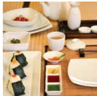
Accessory items to complete the range.