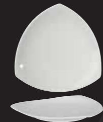
TRIANGLE PLATE P 4185 29.5x29.5 cm. (11 5 / 8 " x 11 5 / 8 " ) 1,040 g. P 4165 26.0 cm. (10 1 / 4 " ) 626 g.